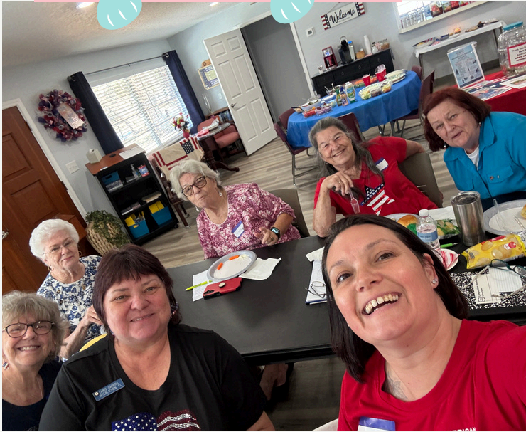
Auxiliary at Post 45 for ABC Training