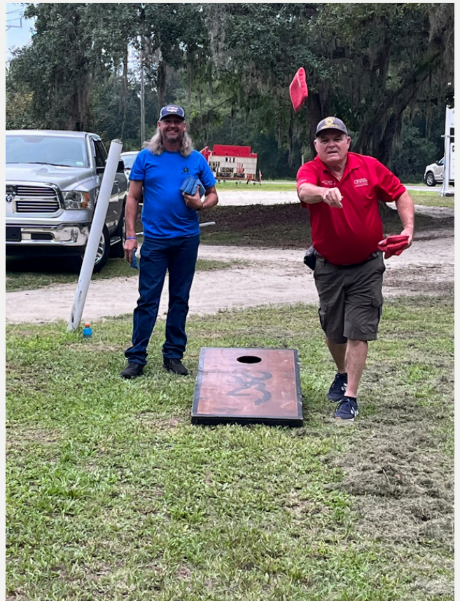
Corn Hole Tournament at the Low Country Boil