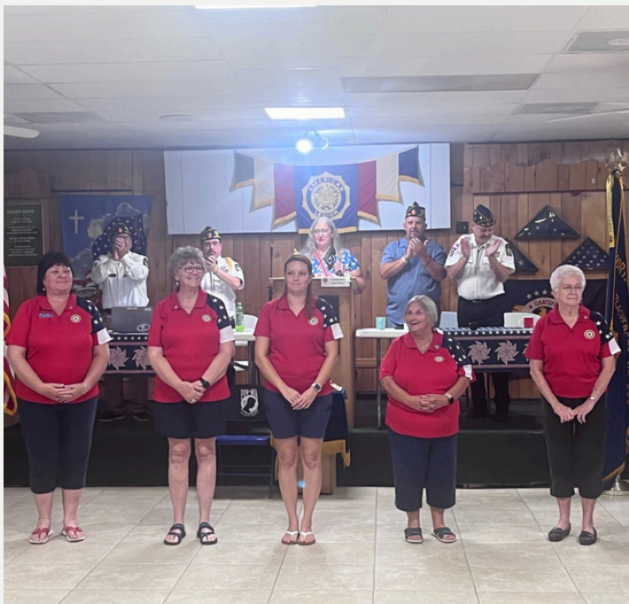
Auxiliary Officers Installation