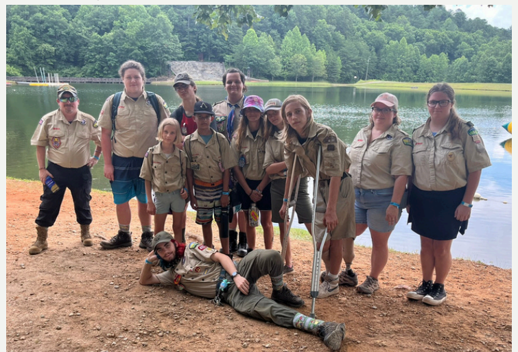
Scouts at Summer Camp

And, as always, share your ideas for fundraising and events at a meeting or with an officer. We want to get more involved and do more things to support our Vets and our community.