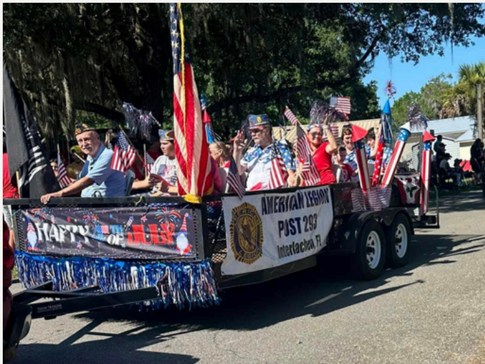
Independence Day Float