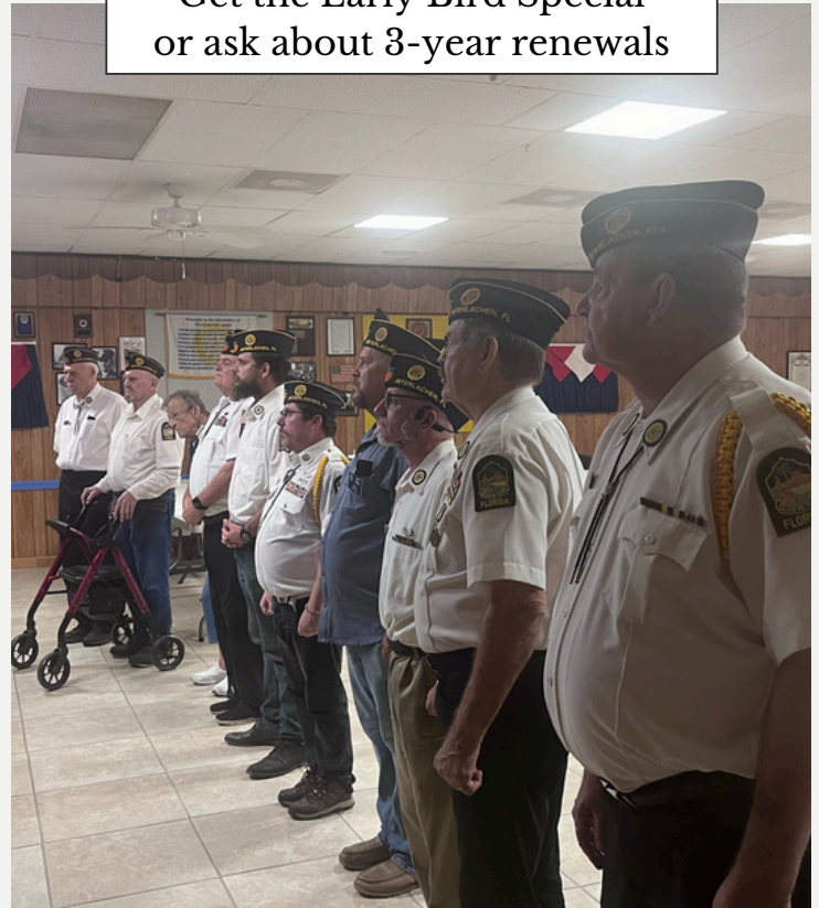
Post 293 Officer Installation

Get the Early Bird Special or ask about 3-year renewals