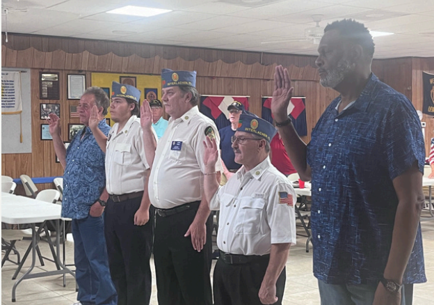
SAL Officer Installation