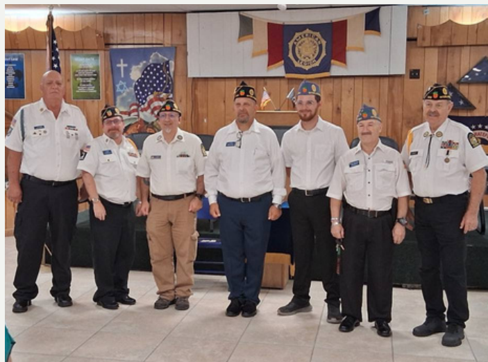
Post and Son's Officer Installation