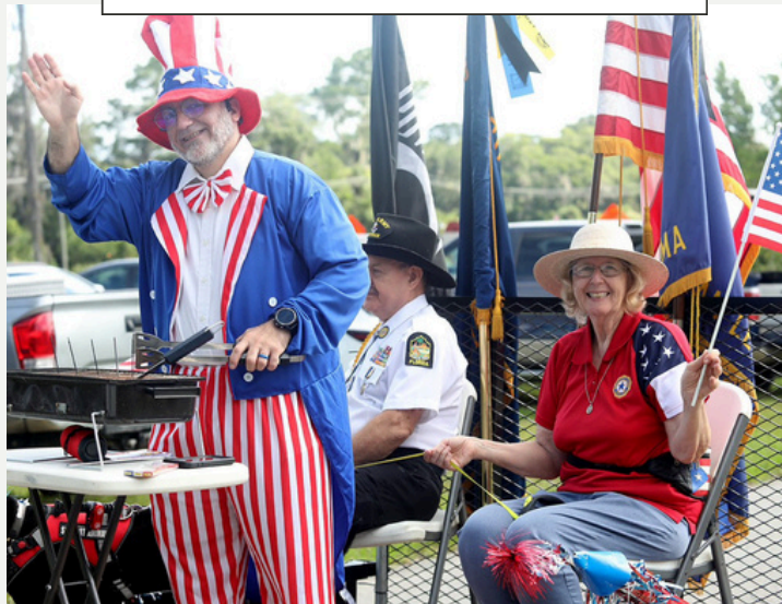
Fourth of July Parade Float