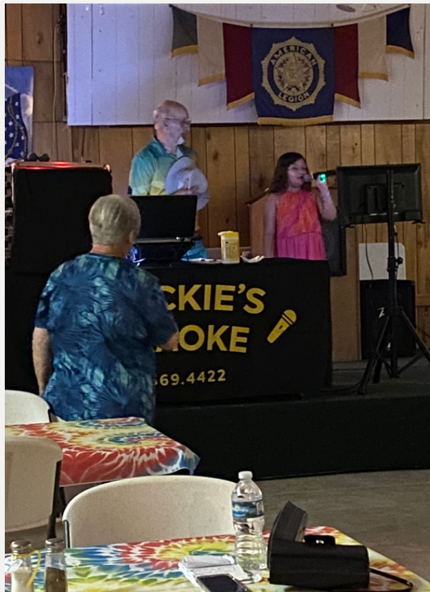
One of our regular Dinner/Dance attendees, this young lady brought us to our feet singing Lee Greenwood's "God Bless the USA"