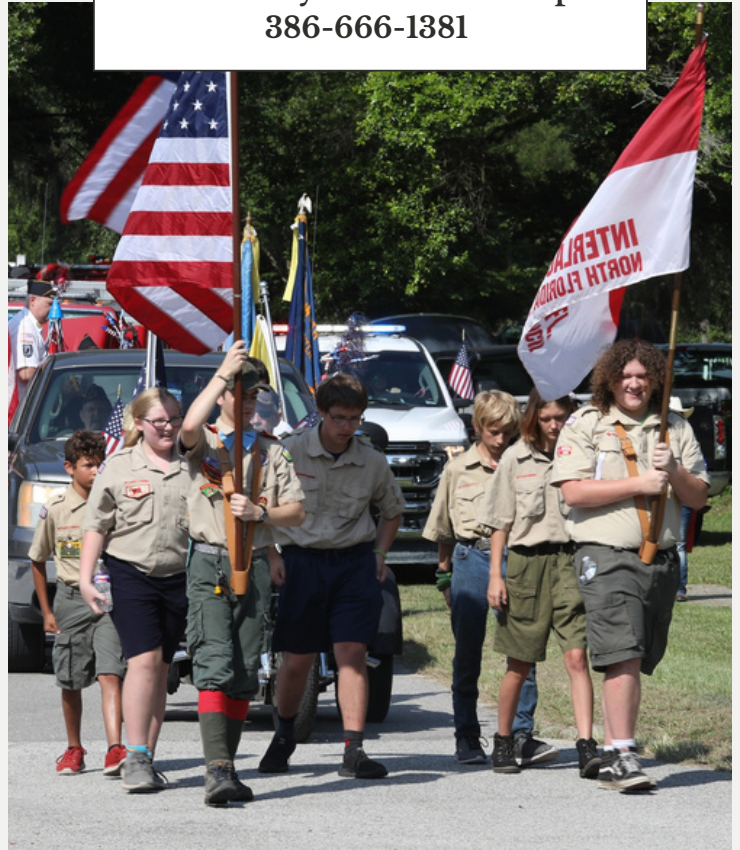
Our Scouts leading the Parade