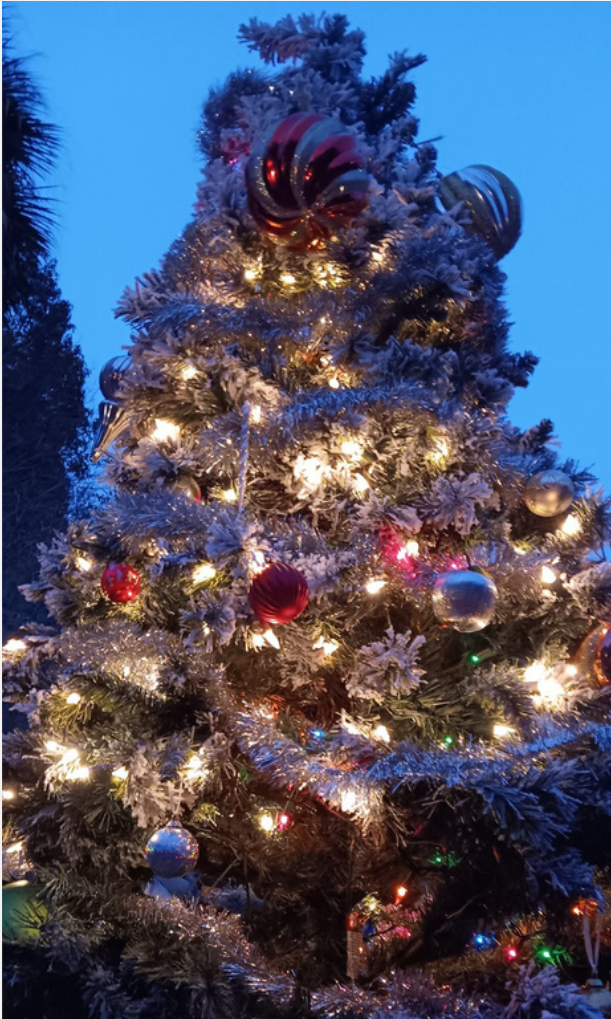
Christmas Tree on our Parade Float