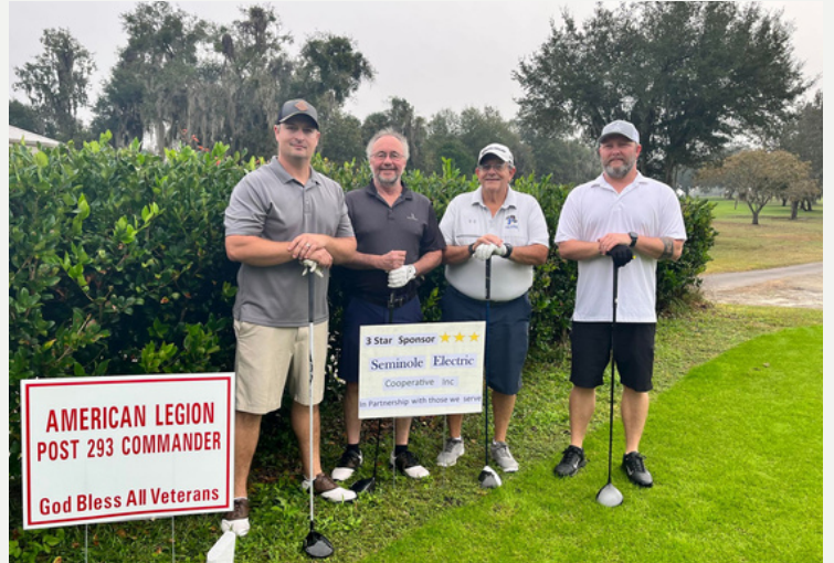
Seminole Electric Team at the Golf Tournament

Finally, share your ideas for fundraising and events at a meeting or with an officer. We want to get more involved and do more things to support our Vets and our community.