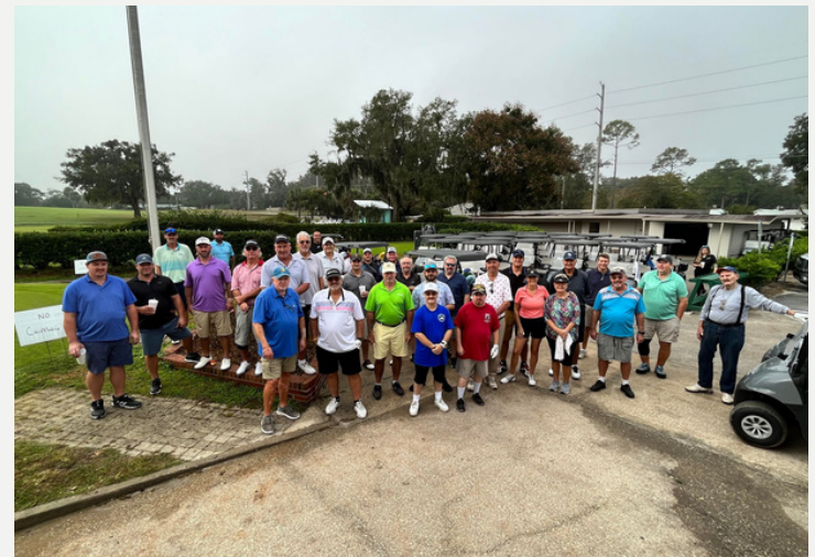
All teams at the Golf Tournament