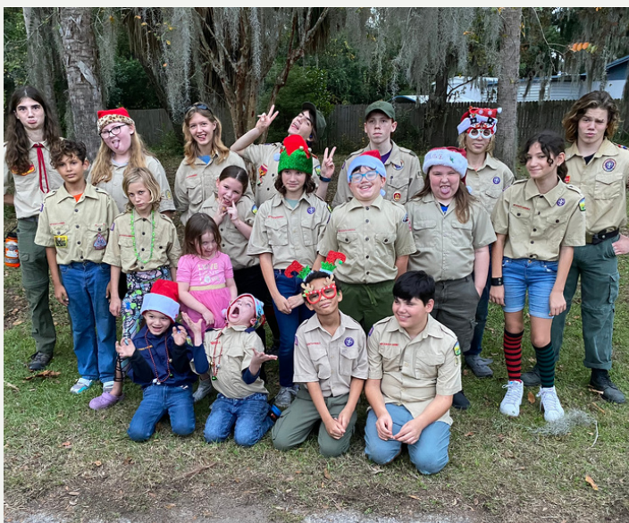
Troops 493 and 394, and Pack 764 goofing before the Christmas Parade

Be sure to see the full calendar at attached to the newsletter.