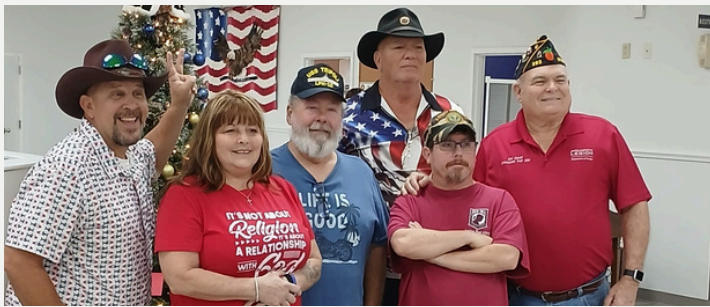
Christmas Giving at the VFW Veteran's Villiage