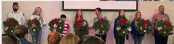
Family and Community Support for WAA