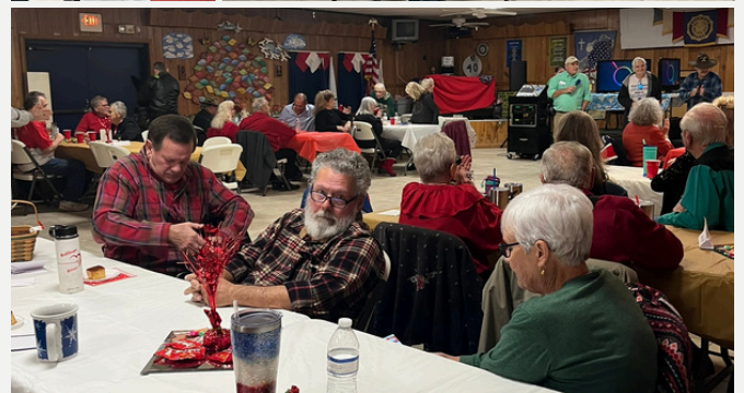
Christmas Crowd at the Holiday Dinner

If you have anything to add or mention, please let me know no later than 1 week following the general meeting!