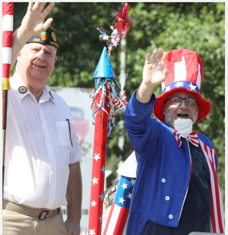
Our Adjutant and "Uncle Sam" on the Parade Float

If you have anything to add or mention, please let me know no later than 1 week following the general meeting! CJ Myers, 2nd Vice, 386-336-3482