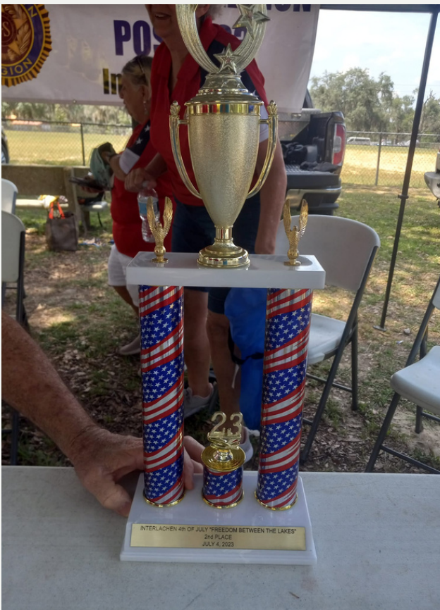
Our Float won 2nd Place at the Parade!

Finally, if you have any ideas for fundraisers or events that you would like to see the Legion get involved in or organize, please share them with an officer or come and share at a meeting. We want to get more involved and do more things to support our Vets.