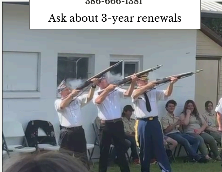
Rifle Team Salute at the Memorial Day Ceremony