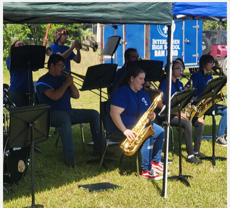
Interlachen High School Jazz Band

Finally, if you have any ideas for fundraisers or events that you would like to see the Legion get involved in or organize, please share them with an officer or come and share at a meeting. We want to get more involved and do more things to support our Vets.