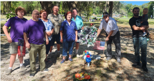
Volunteers for placing Flags at Veterans' Graves