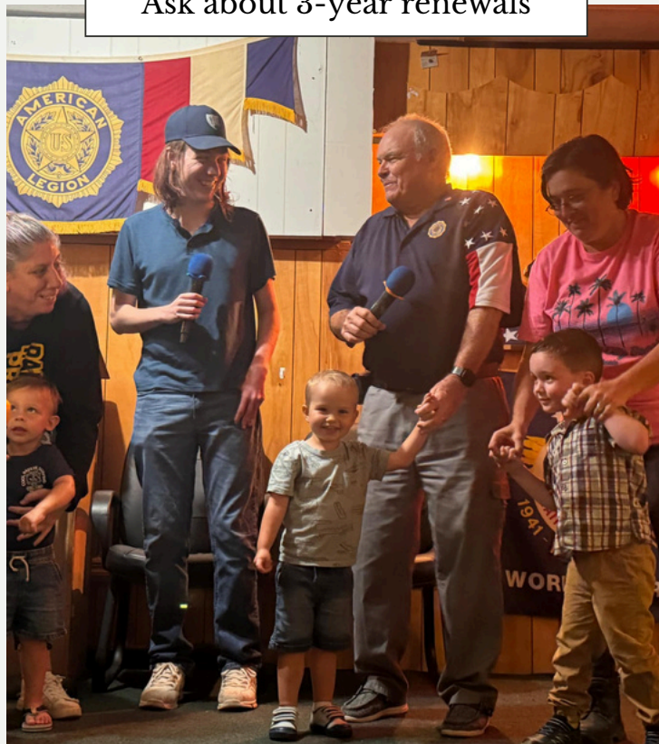
The Karaoke Krew at the Dinner Dance