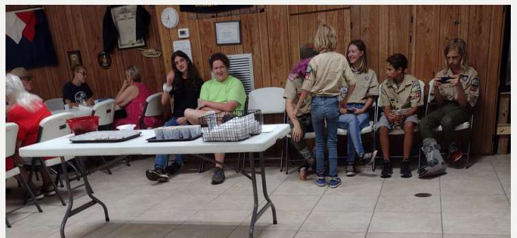
Scouts waiting to Serve Breakfast

If you have anything to add or mention, please let me know no later than 1 week following the general meeting! CJ Myers, 2nd Vice, 386-336-3482