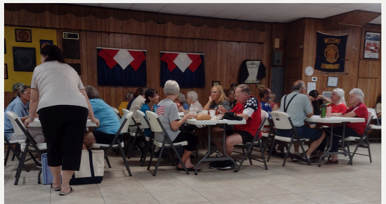
The Breakfast Crowd

Other than the Cubs, these meeting changes are still up to be decided, and would not take effect until October, at the earliest. Stay Tuned!!