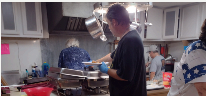
Breakfast Kitchen Crew hard at work